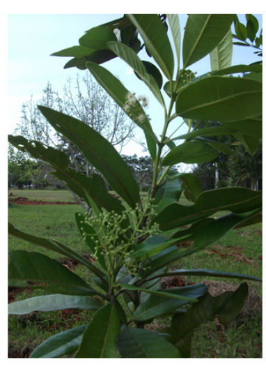
Figure 3. Photo of Pimenta dioica in the natural habitat at National Botanic Garden, Havana, Cuba (Photographs taken by the authors during the collection of the plant).